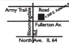
GLENDALE HEIGHTS FIELD COURT Glendale Heights Village Hall