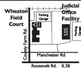
WHEATON FIELD COURT Jack T. Knuepfer Administration Building